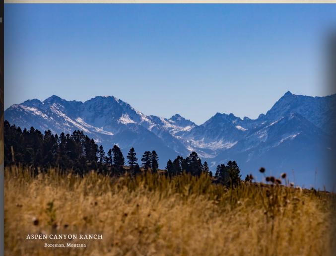
ASPEN CANYON RANCH Bozeman, Montana

FARMS ■ TIMBER ■ RANCHES ■ PLANTATIONS ■ VINEYARDS